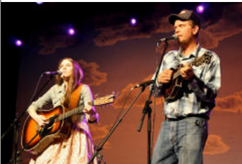
The Whitetop Mountaineers

Charlotte Folk Society second-Friday Gatherings at the Great Aunt Stella Center (GASC), 926 Elizabeth Avenue, are family-friendly and open to the public. Gatherings are free; donations are appreciated and essential to presenting this series in GASC. The front doors open at 7 PM; concerts begin at 7:30 PM and last about one hour. Refreshments, jams, a song circle, and the Charlotte Appalachian Dulcimer Club follow the concert. Parking adjacent to GASC is free. Accessible entry and an elevator are available through the ground floor door on the parking lot side of GASC.