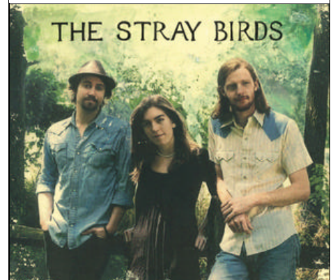
The Stray Birds CD cover

In naming The Stray Birds as one of the Top 10 Folk & Americana Albums of 2012, National Public Radio said: "New bands seeking to make a lasting impression on a nationwide audience are often inclined to lay it all on the line from the get-go. Unleash the full throttle of your instrumental gifts through intense solos and voice-stretching vocal performances, and perhaps folks will have no option but to listen. There's more grace and artfulness, though, in exercising restraint, as The Stray Birds do beautifully on their self-titled debut. Clearly these are players with chops, songwriters with a fierce command of their craft. But they also seem to have a grip on when to lend a hand, and when to let the songs fly on their own. This record was certainly one of the finest debuts of the year from a band to watch." http://thestraybirds.com