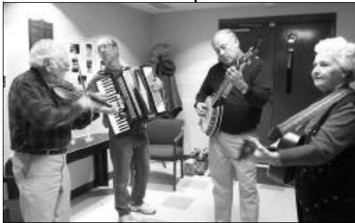
Jamming at the Potluck

At 6 PM, we'll enjoy a half-hour concert of seasonal selections by The Community Singers, an intergenerational folk choir whose