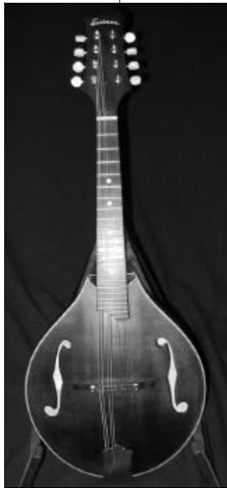
Eastman MD-305 A-Style

Drawing of the winning ticket will take place during the Folk Society's Annual Holiday Potluck, on Sunday, December 11th, at Dilworth United Methodist Church, 605 East Boulevard, in Charlotte. Ticket holders need not be present to win. For tax compliance reasons, the raffle winner must fill out a W-9 form before receiving the instrument. The winner is responsible for all resulting income taxes, if any.