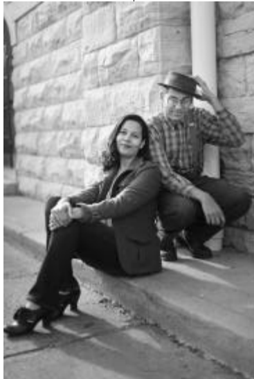
Rhiannon Giddens and Dom Flemmons

Catch them at the Kelly Strayhorn Theater in Pittsburgh performing Hit 'Em Up Style ( http://www.youtube.com/watch?v=_edFcPIpNPM ). The tradition continues!