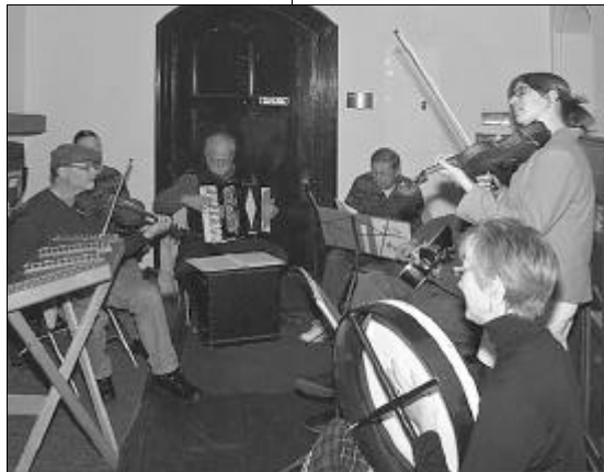
2011 Holiday Potluck Celtic Jam

As is our custom, we'll draw names for door prizes. To be eligible, you need to have become a member since September 1, 2012 or to have renewed already for 2013.