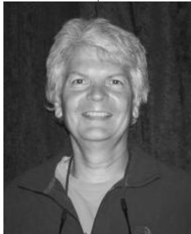
"Cuz"

2. Buddy and Jim - Buddy Miller and Jim Lauderdale - These guys