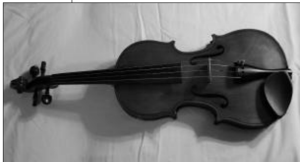
Donated 1998 Otto Glaesel Violin

The Violin Shoppe is located at 2112 East Seventh Street. Folk Society members receive a 10% discount. Be sure to take your CFS member card when shopping. Now is a great time to