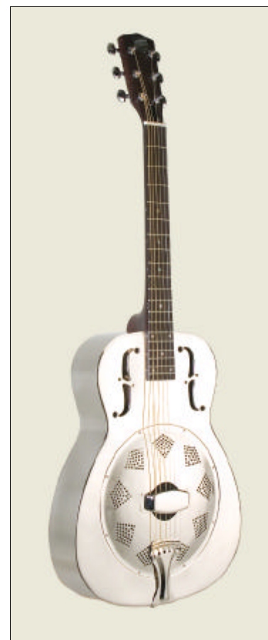
Recording King RM-998-R Resonator Guitar