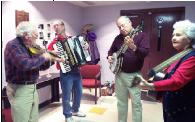
Jamming at the Potluck with friends!

Come at 4 PM for pre-dinner jamming and/or singing. There will be designated spaces in the building for a song circle, a Celtic session, a bluegrass jam, an old-time jam, and a youth jam.