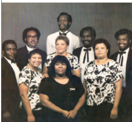
The Glorifying Vines Sisters