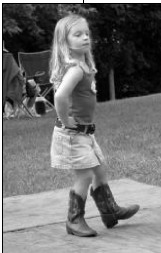
Attitude is everything!

about his favorite fishing hole. Fish are so eager to bite, he claims, that you have to stand behind a tree to be able to bait a hook. When you catch them, the fish are so big that