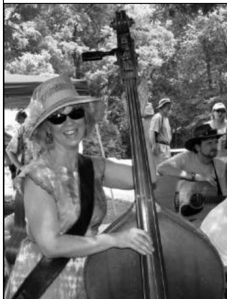
2009 Ice Cream Social Jam