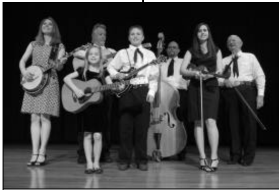
The WBT Briarhoppers

Charlotte’s WBT Briarhoppers just might be the longest-running stringband on the planet. Born in the heyday of live-music radio, they will bring their newest incarnation to the Great Aunt Stella Center, 926 Elizabeth Avenue, for the June 10 th Gathering of the Charlotte Folk Society. The free concert gets underway at 7:30 PM; donations are appreciated and essential to supporting the series. Doors open at 7 PM.