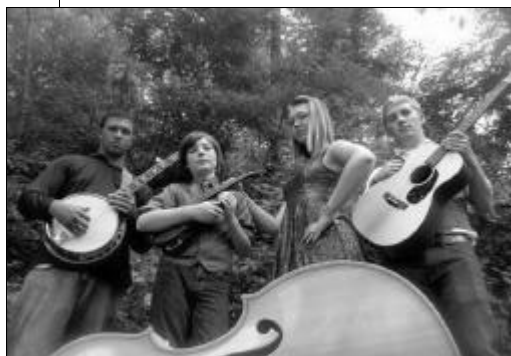
Cane Mill Road