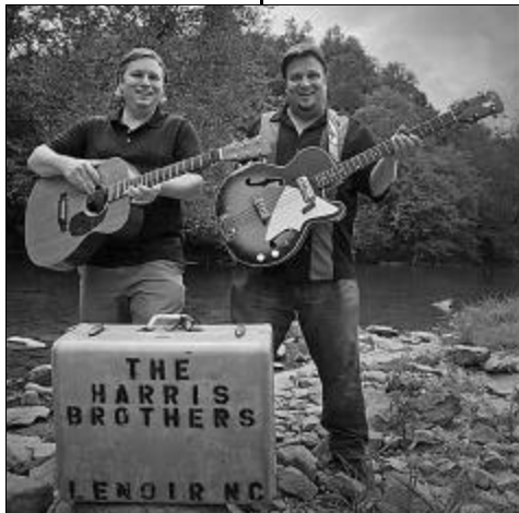
The Harris Brothers