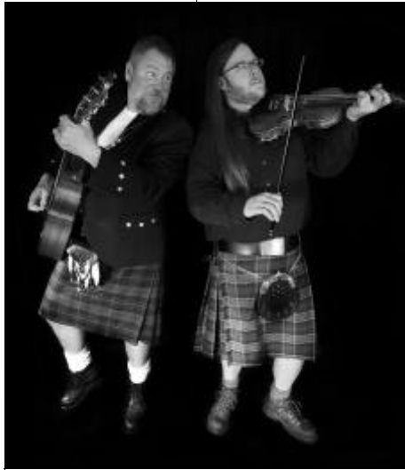
The Thistledown Tinkers

After dinner, we welcome the Thistledown Tinkers to perform a thirty-minute set of holiday selections. Inspired by the Grandfather Mountain Highland