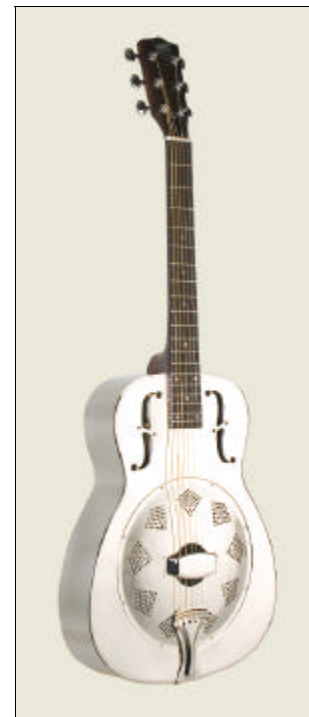
Recording King RM-998-R Resonator Guitar. Value: $999.99