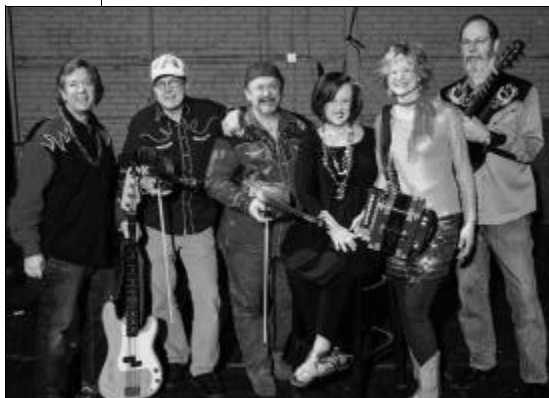
Carolina Gator Gumbo