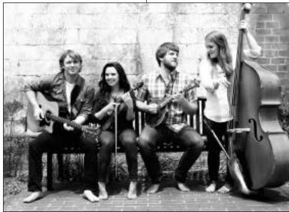
The Barefoot Movement