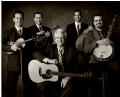
Del McCoury Band