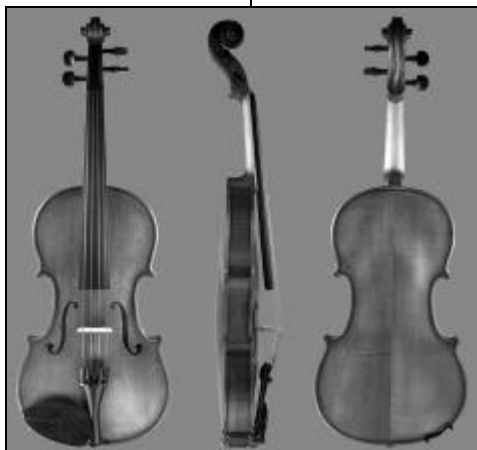
Ivan Dunov Prelude Model 140 Violin

The two instruments will be raffled individually. Mandolin raffle tick-