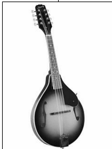
Kentucky A-Model Mandolin

dot markers, and deluxe tuning machines make this a very desirable instrument. Complete with a gig bag, the Kentucky A-Model Mandolin KM-140 is valued at $300.