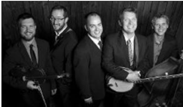
The Gibson Brothers

"They have it all: lead vocals, brother-duet harmony, instrumental virtuosity, ensemble sensibilities, and great original material." — Bluegrass Unlimited Magazine