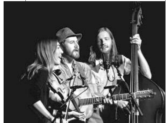
The Stray Birds

lend a hand, and when to let the songs fly on their own. This record was certainly one of the finest debuts of the year from a band to watch." http://thestraybirds.com