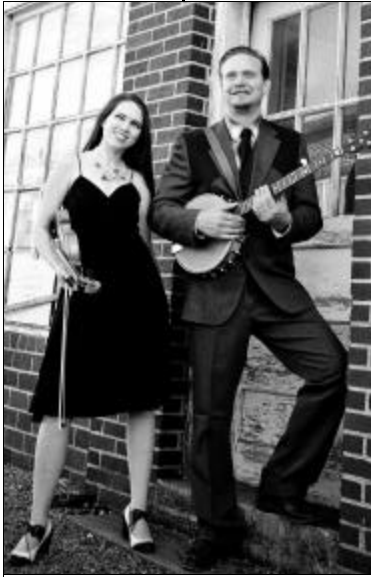
The Whitetop Mountaineers