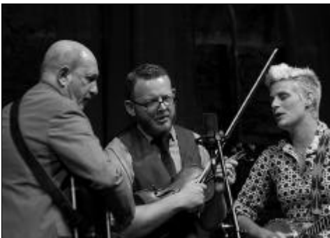
The South Carolina Broadcasters