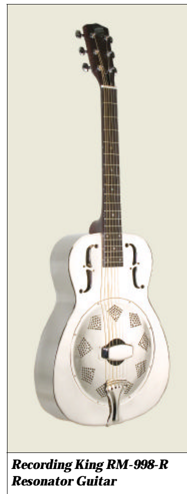
Recording King RM-998-R Resonator Guitar