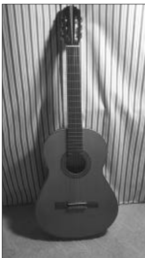
You could borrow this Contreras classical guitar!