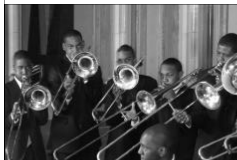
Bailey Clouds of Heaven Shout Band

Come early and purchase a soul food dinner in the church cafeteria (written up in Gourmet Magazine ), opening at 6 PM. Soon after seven o'clock, the trombones of the Bailey Clouds of Heaven kick in – as heard on Smithsonian Folkways Records. Next come the guitars, tambourines, and voices of the Bailey String Band , followed by the Bailey Golden Angels a capella choir.