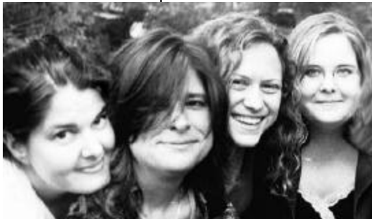
The Near Misses

The Near Misses are currently touring throughout the Southeast while frequently returning to