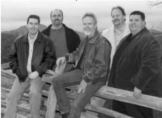
The Circuit Riders

The Circuit Riders' new CD on Pinecastle Records is entitled Let